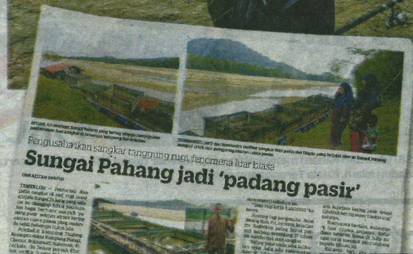
ANTARA pemancing yang hadir di beting pasir Sungai Pahang di Kampung Durian Tawar di Bera semalam.