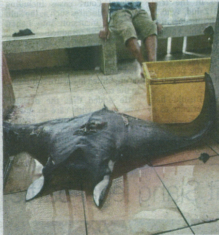
For sale: Divers identified this rarely seen devil ray sold at the Semporna wet market recently.

There are currently 147 shark and stingray species found in Malaysian waters, including Sabah.